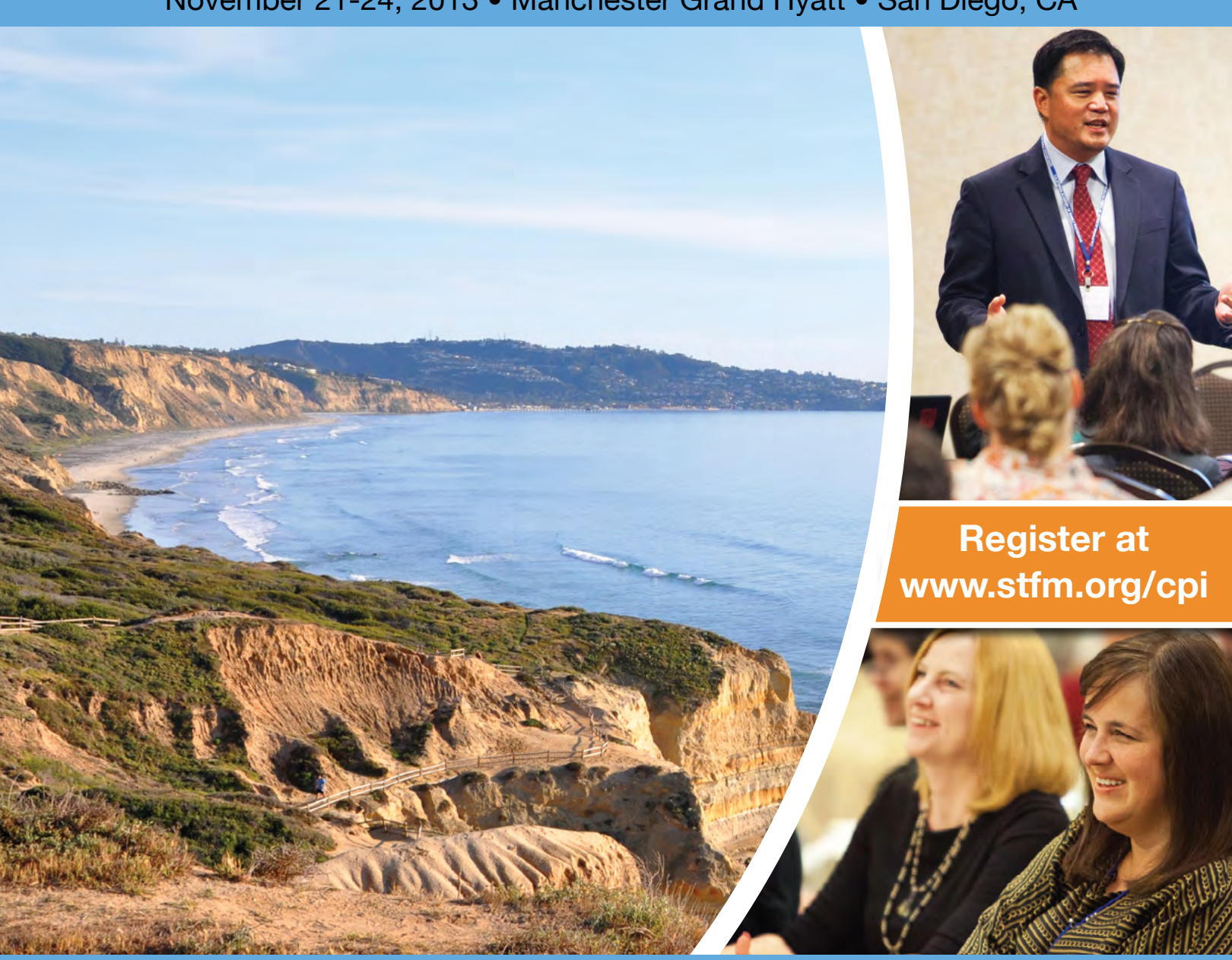
Register by October 21 and Save $75

November 21-24, 2013 • Manchester Grand Hyatt • San Diego, CA